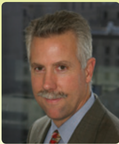
President & CEO, First Choice Health

I want to thank you for your continued support of First Choice Health in 2008. As the Northwest's largest independent PPO network with over 950,000 members, First Choice Health has continued its mission of being a competitive alternative to other large commercial payors.