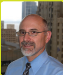
Vice President, Network Management